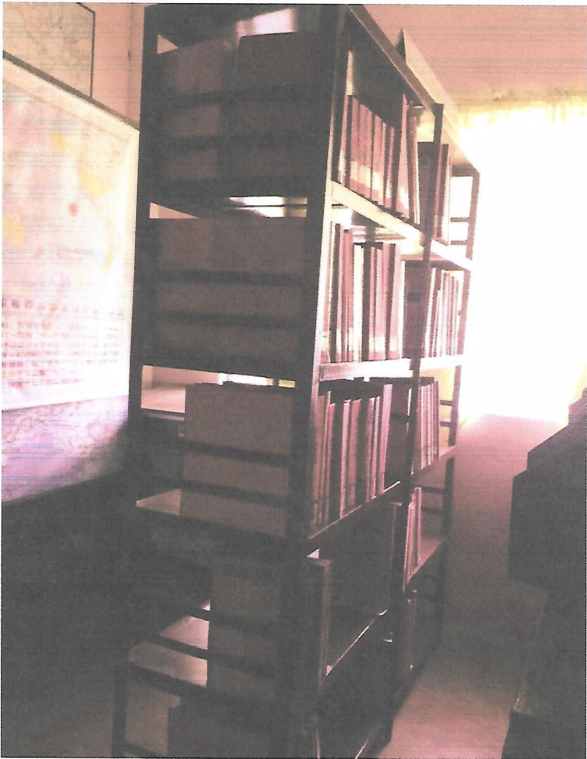
Steel Book Shelf