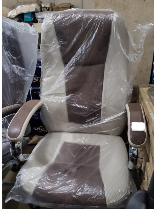
Office Swivel Chair with armrest